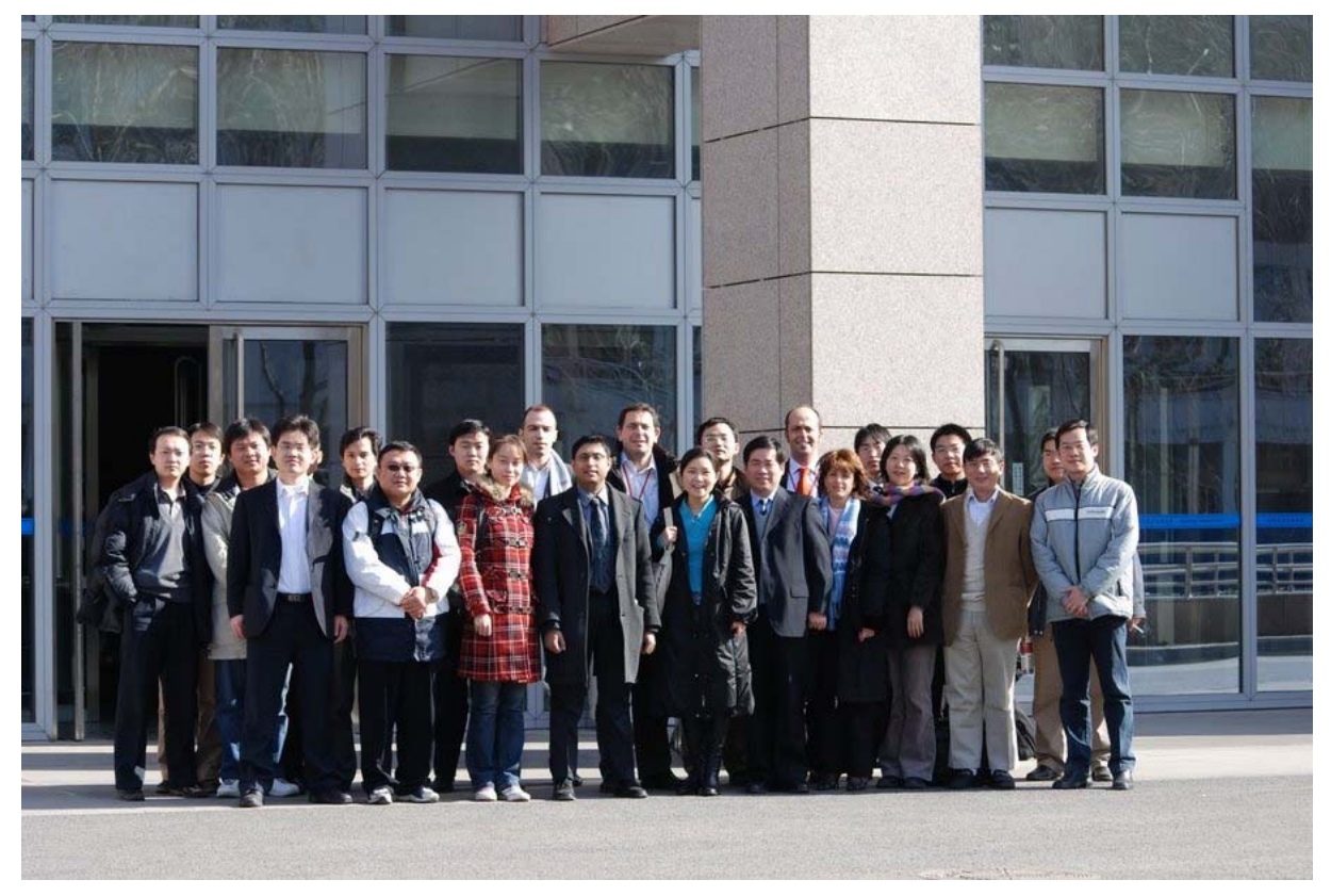
Echogrid First Strategic Workshop 8-9 February 2007

The first workshop was held in Beijing in February 2007, associated with the project kick-off meeting. The major objective was to establish the state of the art in both Europe and China and to analyse similarities and differences, thus leading to first indications of a roadmap for further work. The workshop concentrated on 3 major topics: Grid Open Standards, Grid Programming and Grid middleware. In each case the issues were discussed, in particular considering the scientific and enterprise environments and their differences. It emerged that GRIDs success is hindered by multiple candidates for standards, multiple approaches to programming environments and multiple implementations of middleware. There is an urgent need for characterisation of these offerings to allow comparison of advantages and disadvantages leading hopefully to an agreed starting platform for further cooperative research and development. Key requirements are standardised metadata formats to describe services and resources and associated protocols for interaction between services, resources and services with resources.